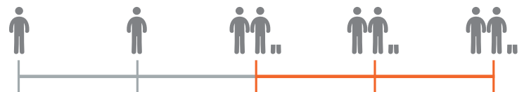
15 new sites more than doubled the enrollment rates for our sponsor's Parkinson's study